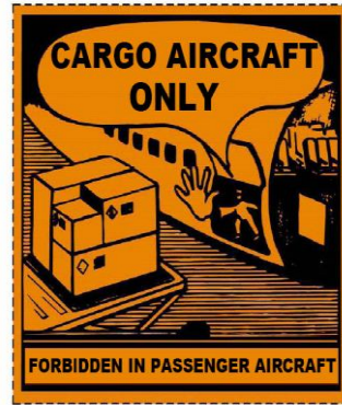
Cargo Aircraft Only Label