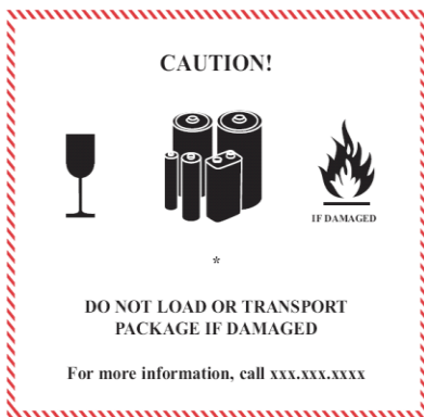
Lithium Battery Handling Label